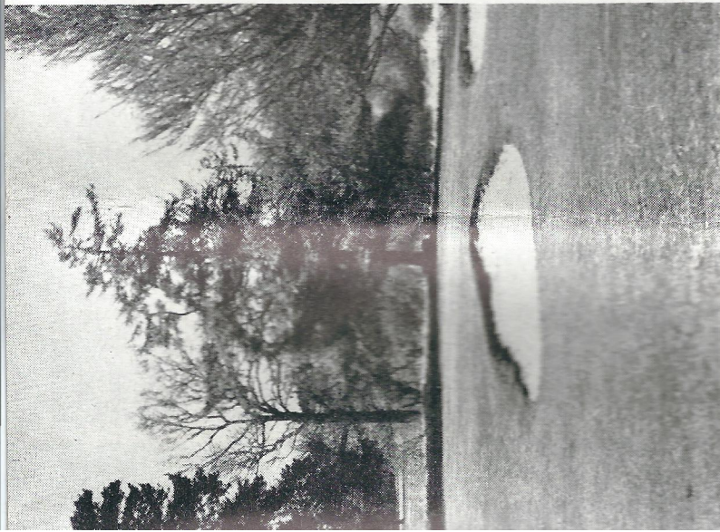
ETIES LINE THE FOURTH GREEN