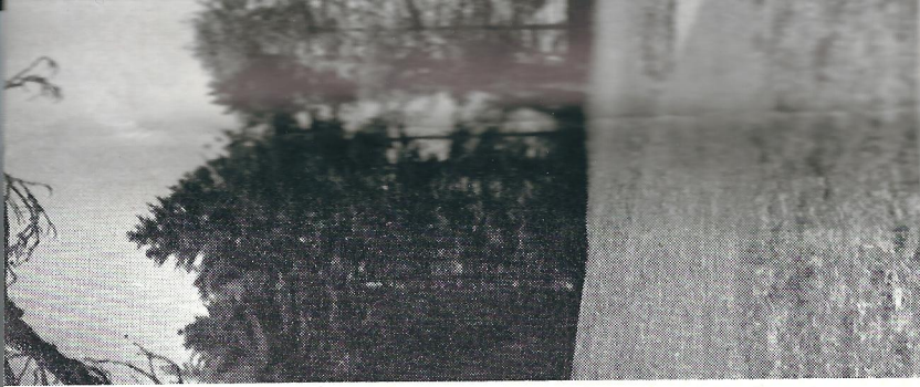
THE TENTH HOLE BE

and the colourful splendour of an of rhododendrons.